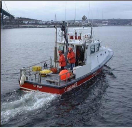
This photo shows the typical size of vessel required for shallow to medium-water deployments.

Rolls-Royce SeaHorse™ adapts to all sorts of mooring scenarios. The basic SeaHorse profiler can operate in water depths up to 200 metres. More shallow-water deployments can be carried out with a minimum of handling equipment and manpower.