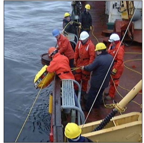
SeaHorse being deployed in 150 metres from the CCGS Parizeau at Station 2 on the Halifax Line.

Data retrieval can also be accomplished with the laptop. This mobility allows the data to be downloaded on the spot or at a later time back in the lab.